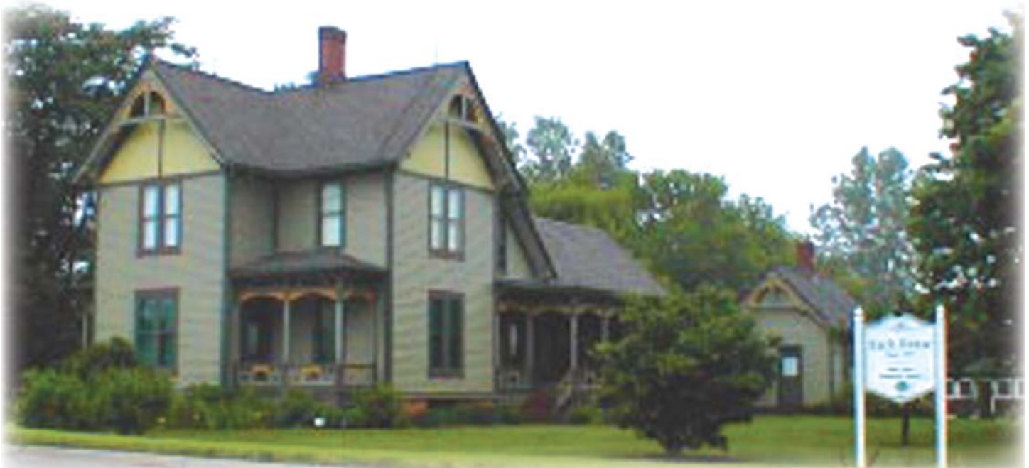
The Hackhouse Museum in Milan

Our historic downtown, has a low 8% vacancy rate, with friendly shop owners. From our churches, schools, and non-profit organizations, citizens have found team comradely, and vision. Milan is located in the middle of where things happen and those who call it home, know it is the place to play, shop and stay!