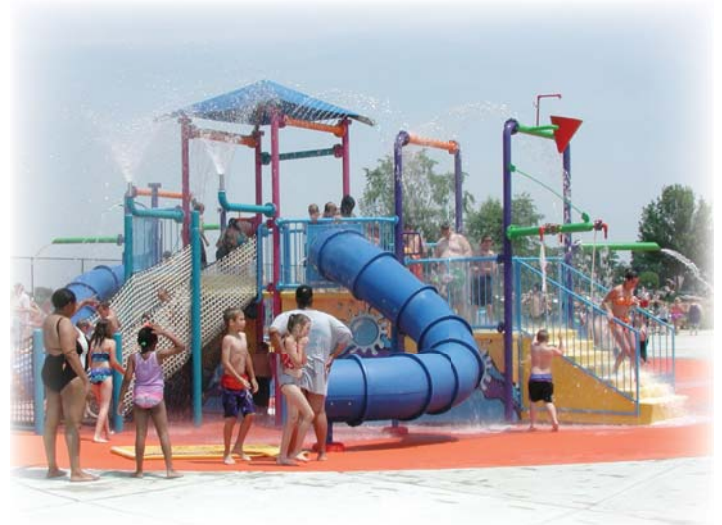
Rolling Hills Park & Waterpark