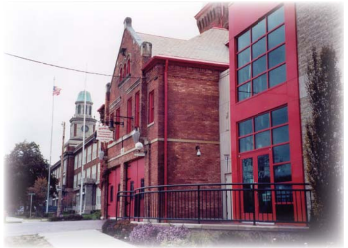
Ypsilanti's Fire Station Museum

One of the most attended and well-known festivals occurs in August. The Heritage Festival turns Riverside Park into a living history experience. A historic encampment reenactment and the Civil War Muster, jazz concerts, parade, antique festival, and historic home tours are all a part of the event that draws 300,000 visitors to the Depot Town and Downtown areas (see events calendar for dates or go to www.ypsichamber.org ).