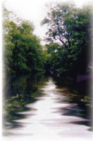
The Raisin River

Progressive Planning for the future, with an eye to preserving the precious heritage and scenic beauty, best describes Manchester today.