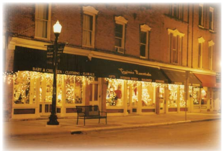
Ypsilanti's Historic Depot Town