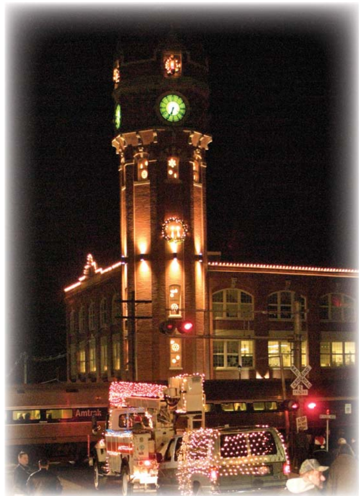
The Chelsea Light Parade

Chelsea's thriving downtown offers both residents and visitors alike the pleasant ambience of tree-lined streets and cheerful storefronts. Shoppers can stroll down historic Main Street, the home of specialty shops, gift boutiques, markets, restaurants and cafes.