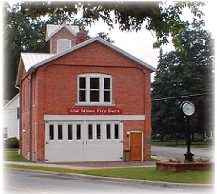
Restored Milan Fire Barn, now used for Chamber and DDA offices

The quaint hometown atmosphere, of tree-lined streets and lamp post lighting, is a huge drawing attraction for people. Milan takes pride in education, having built a state of the art, 50 million dollar high school, while maintaining Paddock Elementary, Symons Elementary and Milan Middle Schools. Milan has a beautifully maintained Park System, with paved walking paths and bike trails. Beautiful Wilson Memorial Park overlooks the scenic Saline river with over 35 acres of land to enjoy. Milan's Nature Park, on the west side of town, has picnic tables, pavillion and play structures as does Wilson Park. Sanford Rd. Park has 139-acres of reclaimed farmland, which has an equestrian center that hosts numerous horse shows, Soccer Club matches and the model airplane flying field. With some 20 plus eateries, Milan