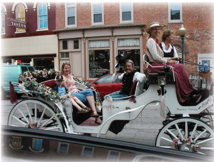
Parading Downtown Chelsea

In Chelsea, festivals and special events create a visitor destination and year 'round fun for residents. Highlights include SummerFest, Chelsea Community Fair, Sounds & Sights on Thursday Nights, Oktoberfest, and Hometown Holiday and the Holiday Light Parade. When looking for energy and a wide variety of activities, look no farther than Chelsea.