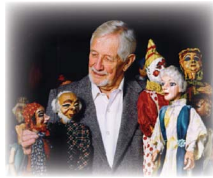
Bixby Marionette Exhibit

There are 11 parks in Saline, occupying 190.54 acres of land and featuring walking trails, lighted tennis courts, lighted softball fields, soccer fields, play structures, picnic areas, and dog parks. Enjoy our city parks in every season! The Saline Rec Center is a 41,000 square-foot facility located at Tefft Park with a basketball court, indoor track, racquetball court, aerobic floor, cardio-weight room, free-weight room, hot tub, aqua climbing wall, 25-yard competitive pool, a warm leisure pool, and child care facility. A host of interesting and healthful classes are available such as aerobics, pilates, yoga spinning, and tai chi as well as leagues for adults and children in golf, soccer, ultimate frisbee, volleyball, basketball, softball, and dodgeball.