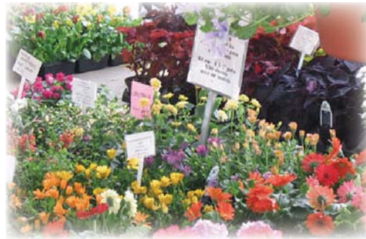
Ann Arbor's Farmer's Market

Arts and cultural resources abound in Ann Arbor, ranging from nationally recognized institutions to locally based organizations. Theater is a vibrant part of the community, with some organizations regularly presenting nationally and internationally acclaimed programs—sometimes in advance of their debuts in larger markets like New York and Los Angeles. On the other side of the spectrum, the smaller theater groups offer opportunities for community involvement