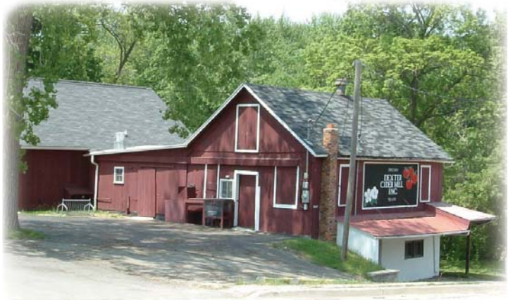
The Dexter Cider Mill

Our community benefits from thriving festivals and family activities sponsored by the Dexter Area Chamber of Commerce. Dexter Daze, Apple Daze, Victorian Christmas with the Holiday Lighting displays and the spring Ice Cream Social all bring the families and residents of our community and those surrounding areas together to celebrate the characteristics and heritage of the Village of Dexter.