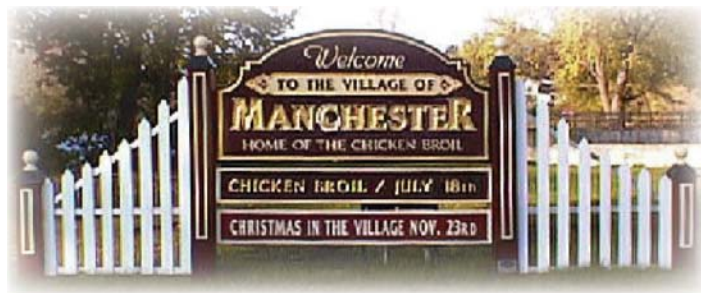
Entering the Village of Manchester