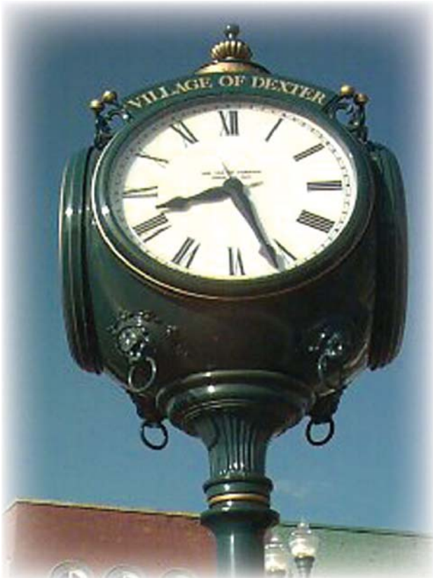
Downtown Dexter's Village Clock

Sincerely, Dexter Area Chamber of Commerce Board of Directors & Staff