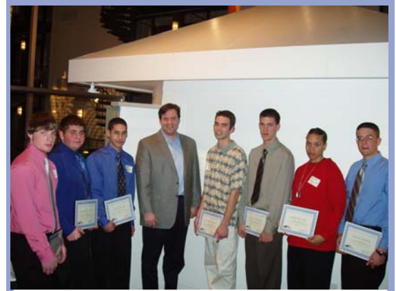
Future Generation of HBA Members. WHBA Foundation Chair with 2005 HBA Scholarship winners. See page 8 for information on the winners.